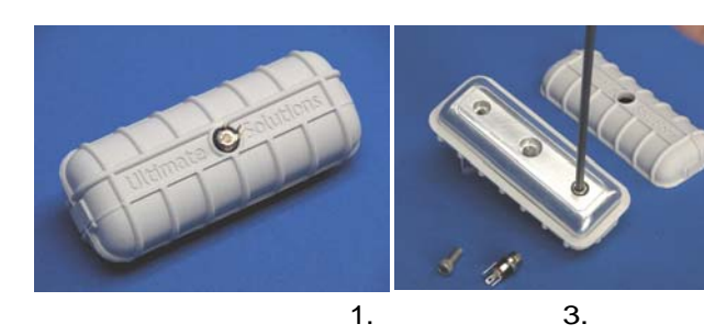
Single-molded Ulti-Pad preforms allow Easy access to electronics after installation.

Single-molded Ulti-Pad preforms are useful for protecting PCB assemblies in sensors and detectors deployed in high-vibration environments and when you need to regain access to the electronics.